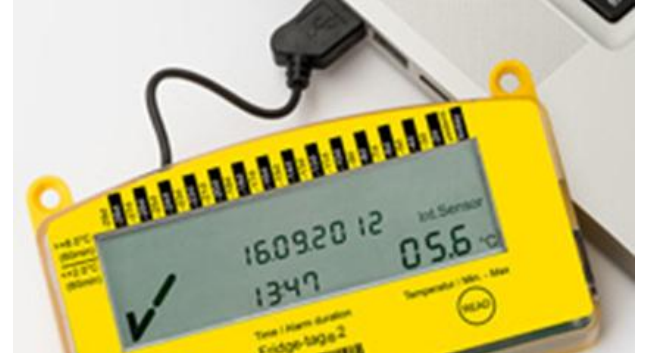
LogTag® temperature recorder