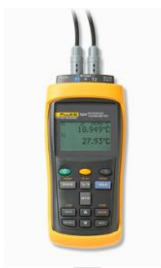
Figure 1 – Example of a reference thermometer